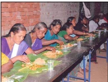
(Below) People are not to be left starving because of their karma. Here a Gospelink sponsor paid to feed some poor folks through a village church.